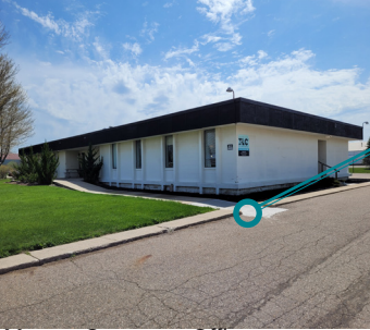
Mason: Corporate Offices