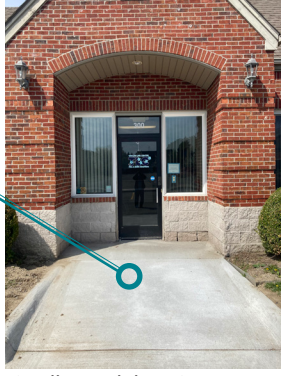
Sterling Heights: Case Management, Therapy Services, Psychiatric Services.