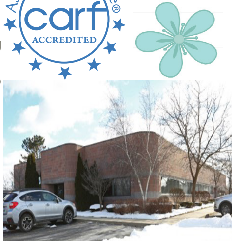
New facility in Flint, opening 2023